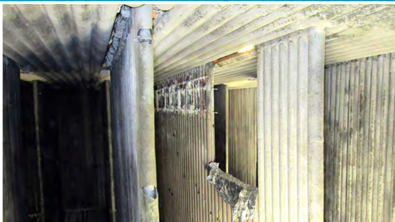
STEAG, IKW Rüdersdorf Repair of bulkhead pipes between superheater 2 and superheater 3 2020