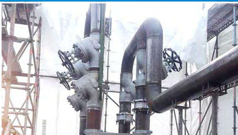
Sonae Arauco, Beeskow plant Span dryer 27 m long, approx. 6 m diameter, thirds and 2 chambers complete replacement of the heating pipes 2017